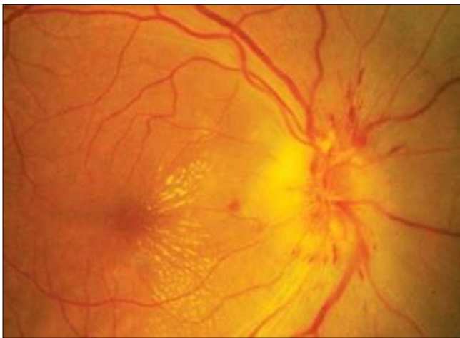
Fig 1: Fundus photograph, right eye